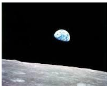
Earthrise, December 24, 1968 Taken by Astronaut William Andes during Apollo 8 Mission

Today, the need for a similar transformation is dire. The 50th anniversary of Earth Day - #EarthRise2020 - will mobilize a grassroots movement against a threat to the planet as great as that posed by nuclear weapons at the peak of the arms race. Humans face many urgent issues today, but only the climate crisis poses an irreversible threat to the habitability of the planet.