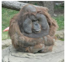
The Giant Cheekpadder

Partner organizations across Indonesia are working with OO for the RESCUE, REHABILITATION, RELEASE, and RETIREMENT of orangutans in the wild. Some of these groups include the Borneo Orangutan Survival Foundation (BOSF), International Animals Rescue (IAR), the Center for Orangutan Protection (COP), the Sumatran Orangutan Conservation Programme (SOCP), the Orangutan Information Center (OIC), the Borneo Nature Foundation (BNF), Orangutan Veterinary Aid (OVAID), and Core Borneo.