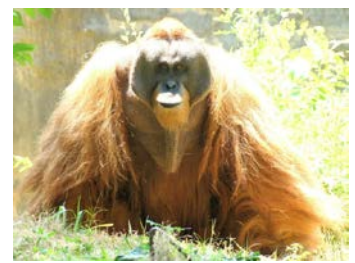
Benny orangutan at Zoo Atlanta is example of photo requested by GAHP.

beta-testing this October 2014. In February 2015, the database will be rolled-out for use by a select group of zoos, and we expect the database to be fully operational to all zoos by October 2015. In the meantime, zoos are encouraged to continue to submit exams to the GAHP as they normally do. Another way zoos can help develop the new database is by sending us photos.