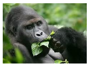
Adult Grauer's gorilla

The Grauer's gorilla population, Gorilla veringei graueri, (formerly known as the eastern lowland gorilla) has decreased for many reasons. The core of Grauer's gorilla habitat lies in the vast lowaltitude Congo forest, but the remaining gorilla populations there are extremely fragmented, due to poaching related to ongoing conflict and the presence of rebel groups, mining, the demand for bushmeat, and unsustainable usage by impoverished communities. In Central and West Africa an estimated 3-5 million tons of bushmeat is obtained by killing wild animals